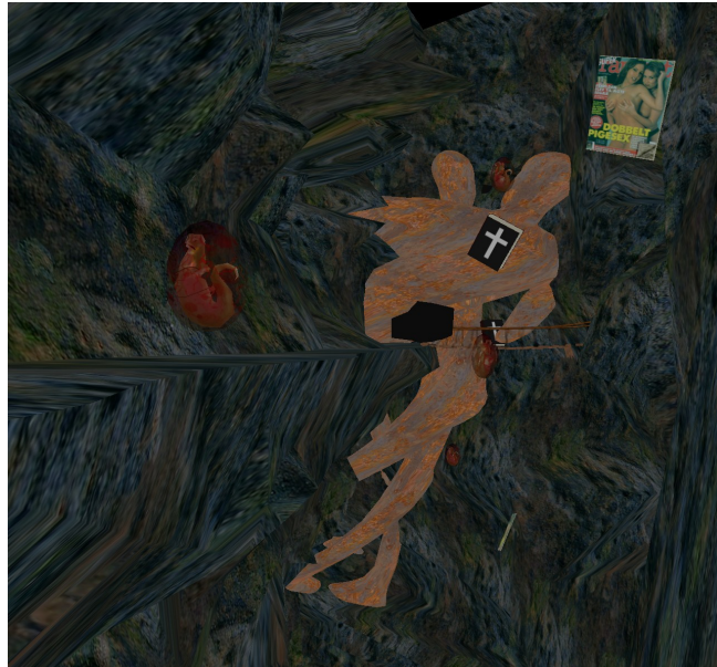
The Cave: Two gigantic intertwined figures rotate slowly as the camera fly through. Symbolic objects fly by: a monstrous fetus, the bible and an erotic magazine.

Through four scenes, “the cave”, “the beach”, “the ocean”, “the aquarium” – each name designating a virtual scenography with surrealistic content and style – the relationship and the central question are discussed and negotiated in various ways.